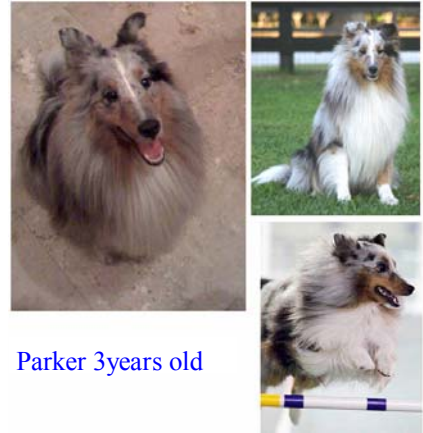
Parker 3years old

Everybody, please don't take any chances with your precious ones...It only takes a split second for them to be gone...and once out of your sight they are in flight and hide mode. It may not be macho to have your Sheltie on a leash but for his safety do it anyway!