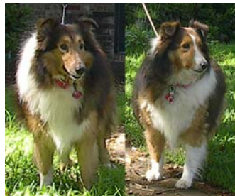
Foxie a Survivor

Note: We lost Foxie 10-30-2007 and now Princess is gone too. They lived here off and on since April 2003.